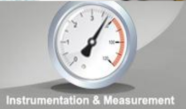
Instrumentation & Measurement